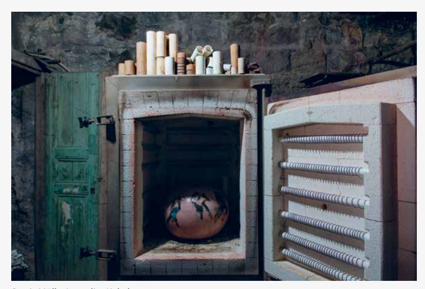
Samir Müller's studio, Kahale Photo: Ghadi Smat, 2013

Potters mold clay paste using different techniques which can sometimes be combined to achieve the desired form. These included handbuilding using the coiling procedure, in which snake-like ropes of clay are wound around one another; wheel-throwing to obtain circular forms; or slip casting for the repetition of forms.